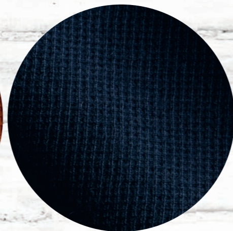
Waffle Poly Cotton 210gsm