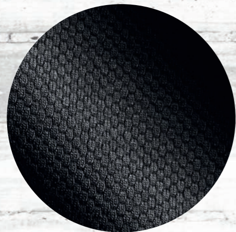
Modal® Dobby Knit 70% Modal® 30% Polyester 230gsm