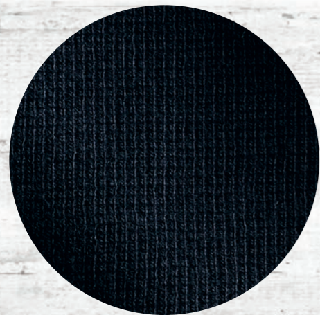
Waffle 100% Cotton 240gsm