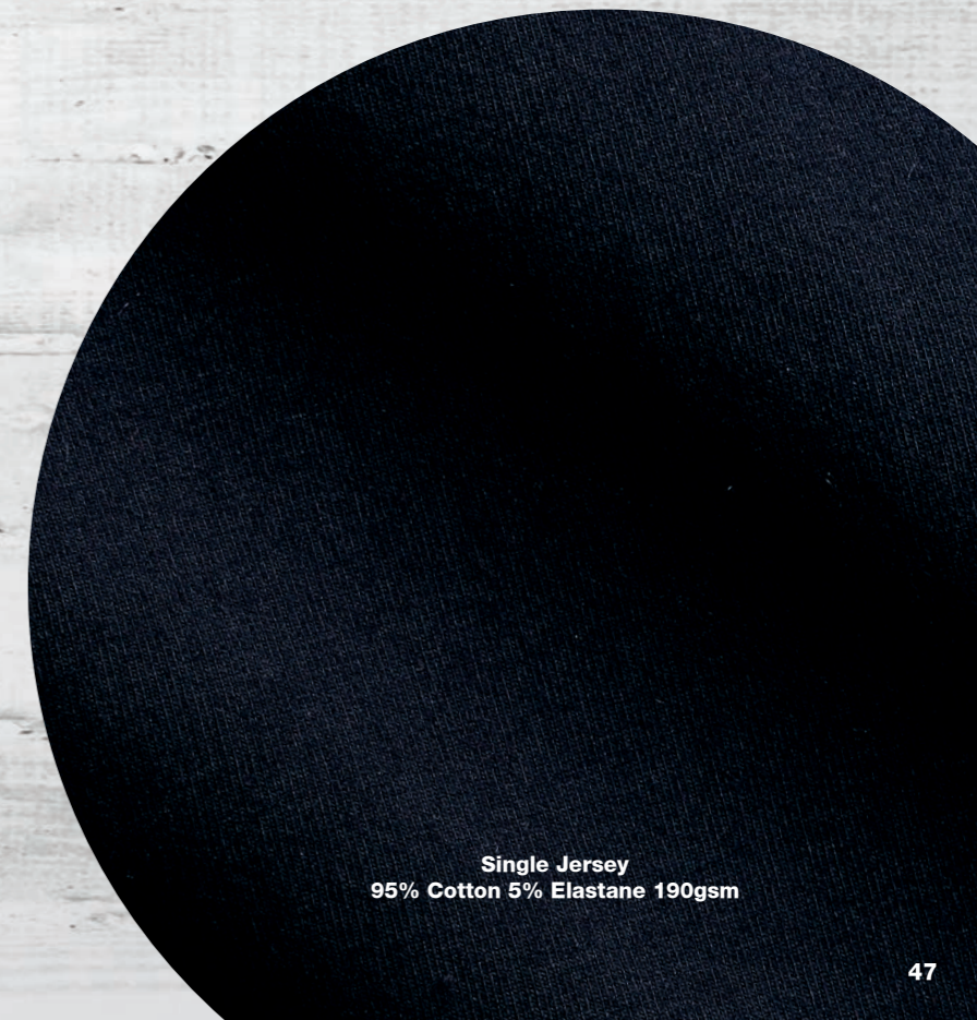
Single Jersey 95% Cotton 5% Elastane 190gsm