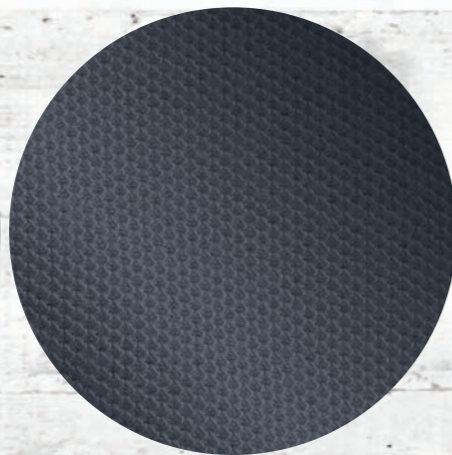
Pique Poly Cotton 230gsm