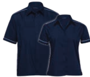
TMT, WTM: NAVY/WHITE PAGE 68

Our wide range of men's and women's woven shirts offer you a selection of his and her styles to create your working wardrobe. The Standard + Barkers offers coordinating colour pallets to create a cohesive, well tailored look for your business uniform.