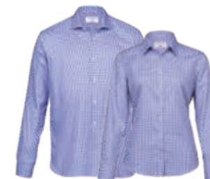
BSC, WBSC: NAVY/BLUE/WHITE PAGE 18