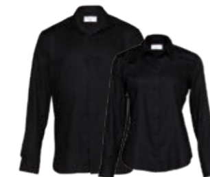
BTY, WBTY: BLACK PAGE 4