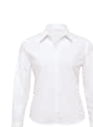
WTEL: WHITE PAGE 53