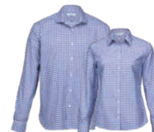
TIC, WTC: FRENCH BLUE/WHITE PAGE 22