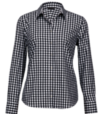
TAPERED FIT SHIRTS Slightly slimmer silhouette for a more tailored fit