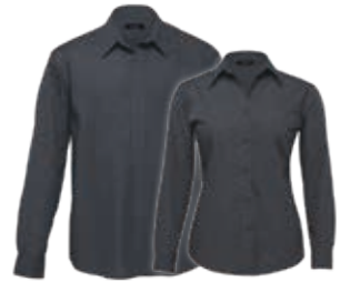
EOE, WEOE: CHARCOAL PAGE 40