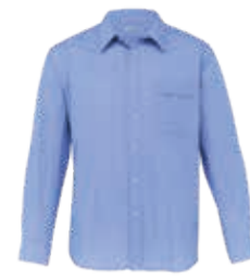
TTBL: BLUE/WHITE PAGE 44