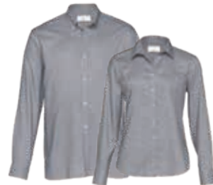
BNO, WBNO: GREY PAGE 8