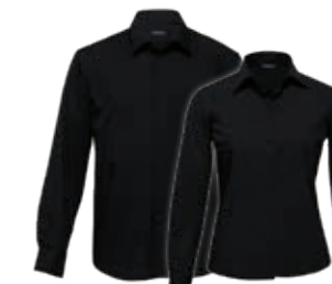
TRLS, WTRLS: BLACK PAGE 56