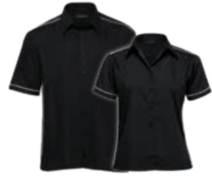
TMT, WMT: BLACK/WHITE PAGE 68