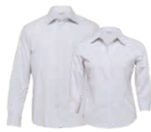
TU, WTU: SILVER/WHITE PAGE 42