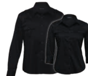
TPL, WTPL: BLACK PAGE 59