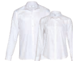
BOR, WBOR: WHITE PAGE 2