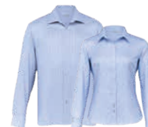
TNP, WTNP: BLUE/WHITE PAGE 38