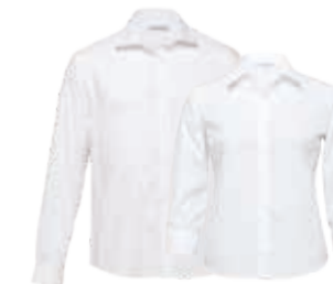
TE, WTE: WHITE PAGE 54