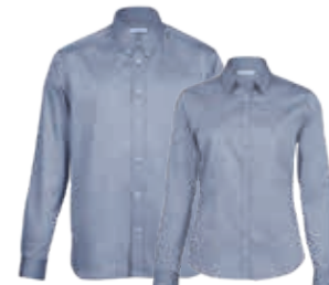
TBT, WBT: STEEL NAVY PAGE 36