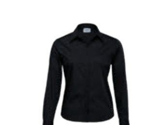
WTEL: BLACK PAGE 53