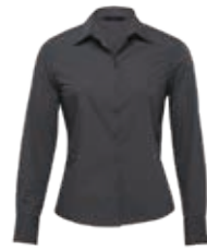
WTRL: CHARCOAL PAGE 56