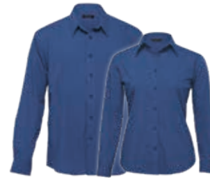
EOE, WEOE: FRENCH BLUE PAGE 40