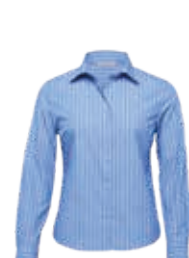
WES: BLUE/WHITE PAGE 48