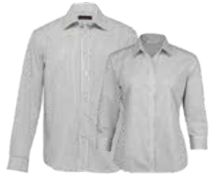
TF, WTF: WHITE/BLACK PAGE 32