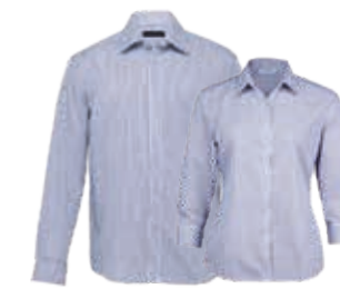
TF, WTF: WHITE/NAVY PAGE 32