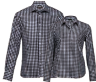
THC, WTHC: BLACK/WHITE PAGE 28