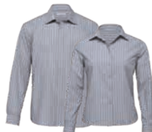
ES, WES: GREY/WHITE PAGE 48