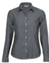
WTMC: CHARCOAL PAGE 58