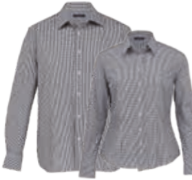
TKC, WTKC: BLACK/WHITE PAGE 26