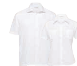
TL, WTL: WHITE PAGE 65