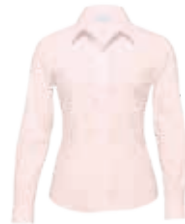
WTMO: PINK BLUSH PAGE 62