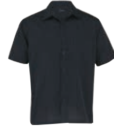
TOSS: BLACK/WHITE/CHARCOAL PAGE 67