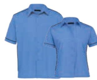
TMT, WTM: OCEAN/NAVY PAGE 68