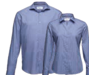
BFCS, WBFCS: NAVY/WHITE PAGE 6