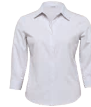
CLASSIC FIT SHIRTS Relaxed looser modern fit