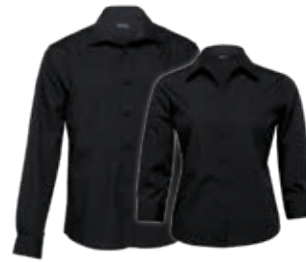
TE, WTE: BLACK PAGE 54