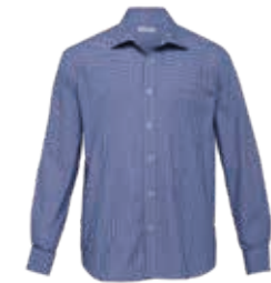
TSC: NAVY/WHITE PAGE 25