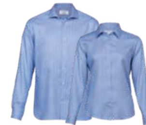
BQU, WBQU: COBALT BLUE PAGE 14