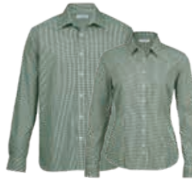
TKC, WTKC: GREEN/WHITE PAGE 26