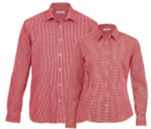
TKC, WTKC: RED/WHITE PAGE 26