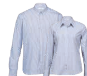
TCDH, WTCDH: WHITE/NAVY/BROWN PAGE 24