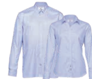
BHC, WBHC: SKY BLUE/WHITE PAGE 20