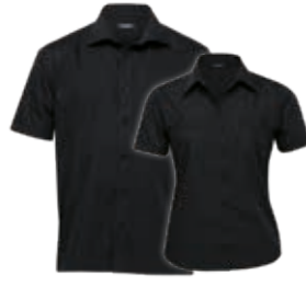
TL, WTL: BLACK PAGE 65