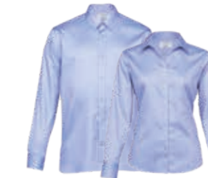
BCL, WBCL: FRENCH BLUE PAGE 10