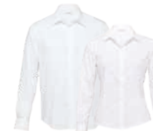
TRLS, WTRLS: WHITE PAGE 56