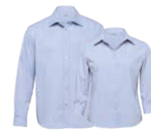
TU, WTU: BLUE/WHITE PAGE 42