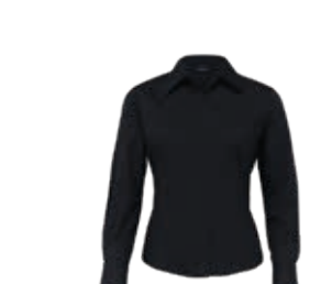
WTV: BLACK PAGE 64