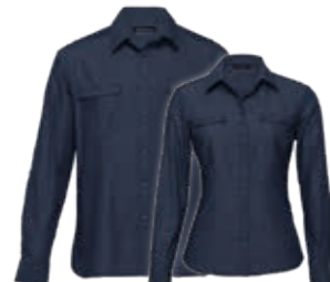
TG, WTG: INDIGO PAGE 60