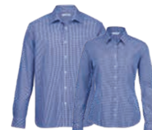
TKC, WTKC: NAVY/WHITE PAGE 26