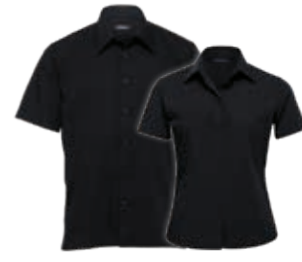
TRSS, WTRSS: BLACK PAGE 66