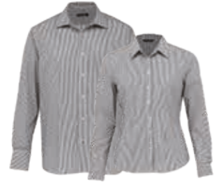
TWS, WTWS: BLACK/WHITE PAGE 46