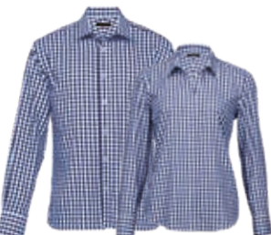
THC, WTHC: NAVY/WHITE PAGE 28